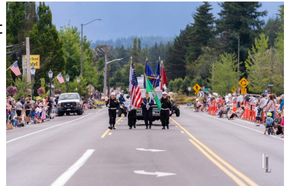
The parade route along North Bend Way into Down Town Area was lined by hundreds of spectators.

The Festival at Mt Si Grand Parade on August 13th was viewed by over 2,000 spectators along the parade route in Downtown North Bend. Our own Post 79/Unit 79 Color Guard led the parade followed by the truck with all the 6 military service flags Here are just a few photos from the parade.