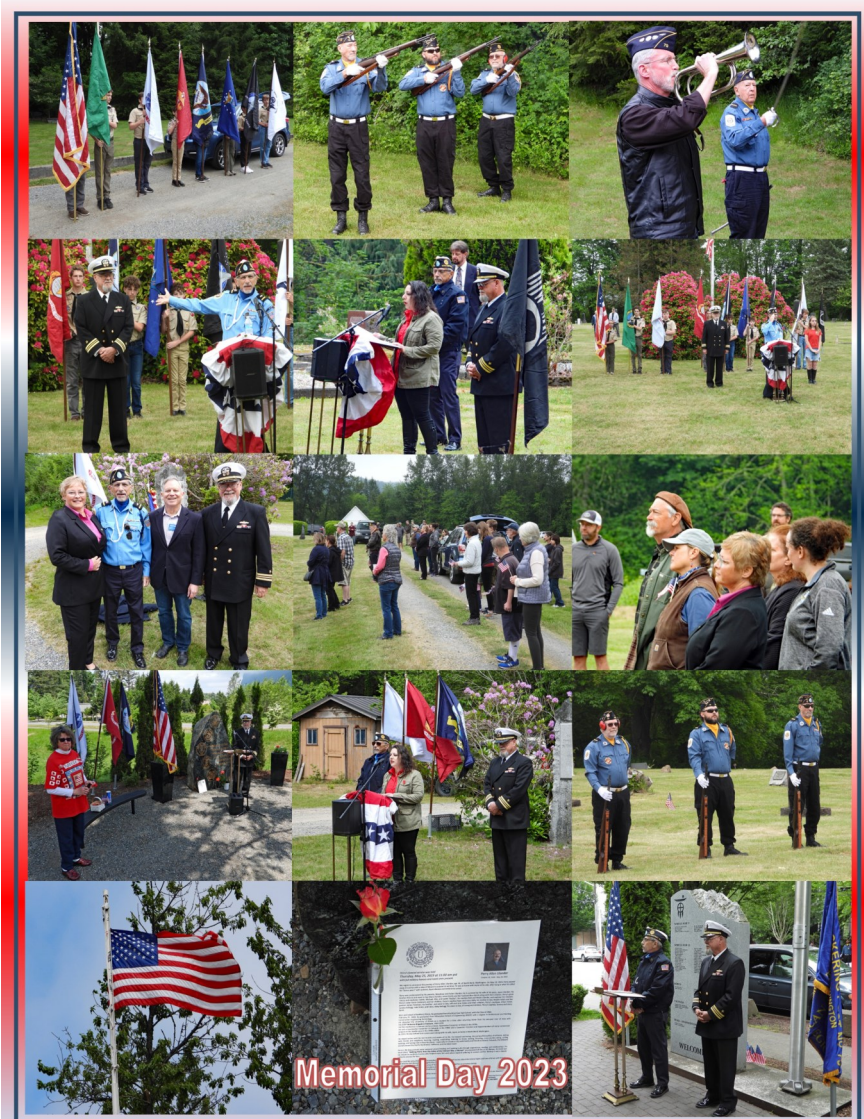
Memorial Day 2023