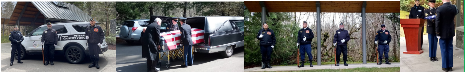
Vehicle, the casket being removed from the hearse, our 3-rifle Firing Party, and Washington Army National Guard folding the Flag before being presented to the Next Of Kin}

(Some photos from April Military Honors at Tahoma National Cemetery showing the Snoqualmie Tribe's Veterans Courtesy