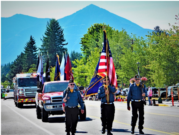
Festival at Mt Si Parade in North Bend

Our first parade was in North Bend on Saturday Aug 12 at the Festival at Mt Si where our Snoqualmie Valley Veterans Color Guard led the Grand Parade thru Downtown North Bend. The Color Guard was followed by a pickup truck carrying the flags of all six Branches of Service.