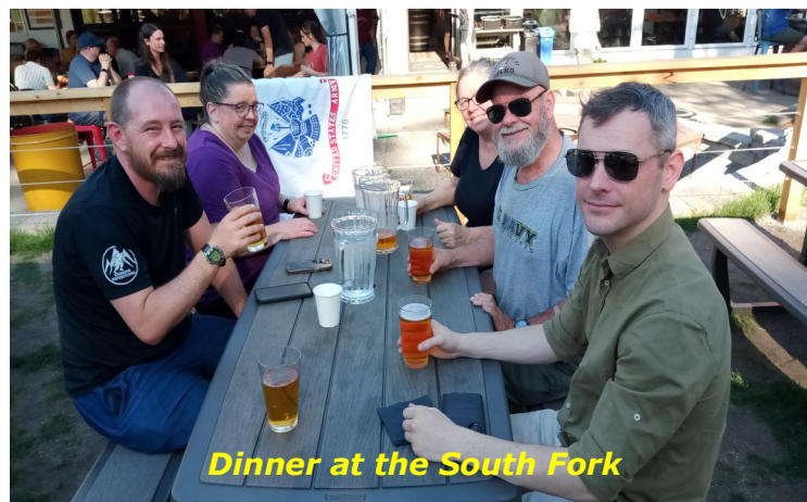
Dinner at the South Fork