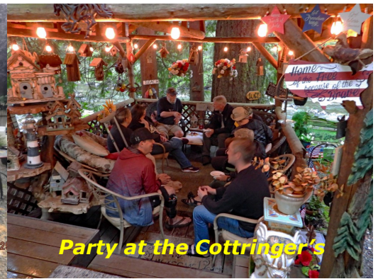
Party at the Cottringer's