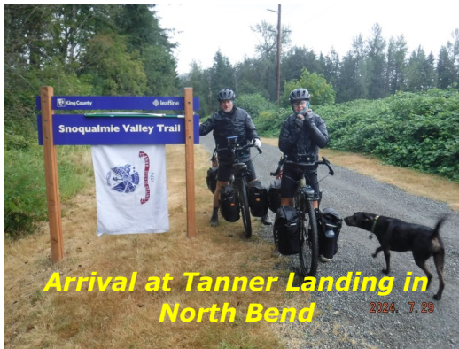
Arrival at Tanner Landing in North Bend 2024. 7.29